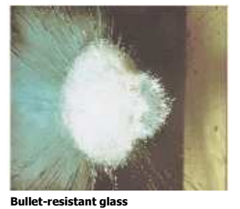
A .44 Magnum bullet shatters 1-3/16" thick bullet-resistant glass, creating a dangerous situation.