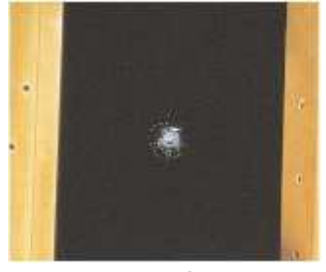
LEXGARD SP 1250 laminate 1-1/4" thick LEXGARD SP 1250 laminate can absorb full ballistic impact without penetration or shattering.